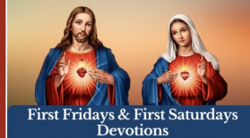
First Fridays & First Saturdays Devotions

*Sat, April 12 from 9-11 a.m. with focus on Easter Vigil with review of Holy Thursday & Good Friday with practice of Responsorial Psalms as time allows.