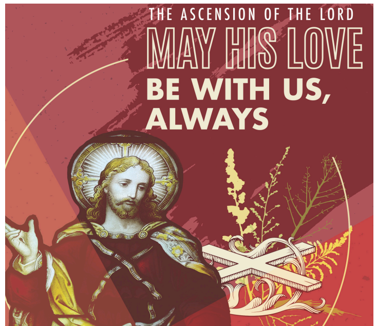
THE ASCENSION OF THE LORD

Where did he go? Many times when we think of those who have died, we imagine escape from this world to a purely spiritual place. Jesus' Ascension can leave us in a place of confusion. What happens to Jesus? And why does this matter to us? The Ascension has been confirmed in the Creed for two millennia. In Jesus' Ascension, we're invited to consider our own ultimate end. Regardless of death's reality now, we believe in the resurrection of the body and the reunification of body and soul. One day, earth and heaven will meet perfectly and without end. We anticipate this "new heaven and a new earth" at every Mass and throughout the beauty, truth, and love of the Church and her members. Today, celebrate a foreshadowing of the fullness we all await!